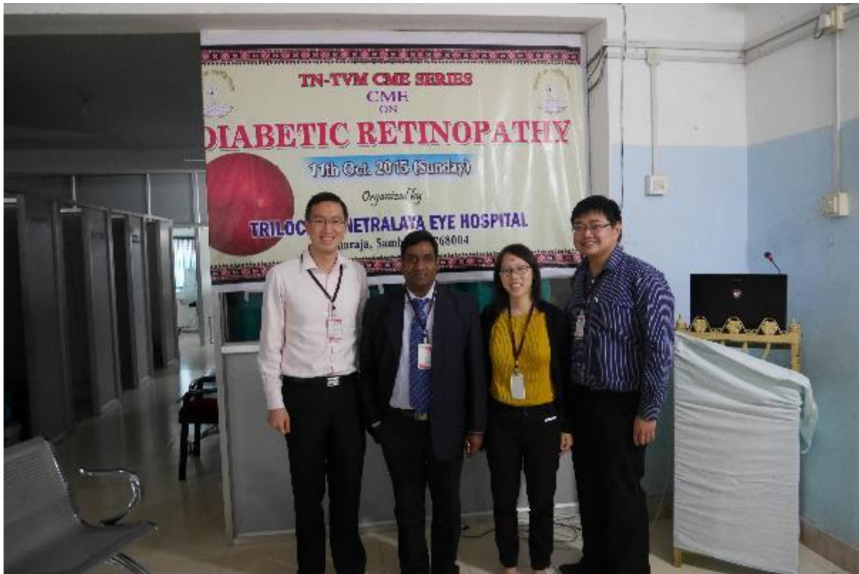
Guest speakers united