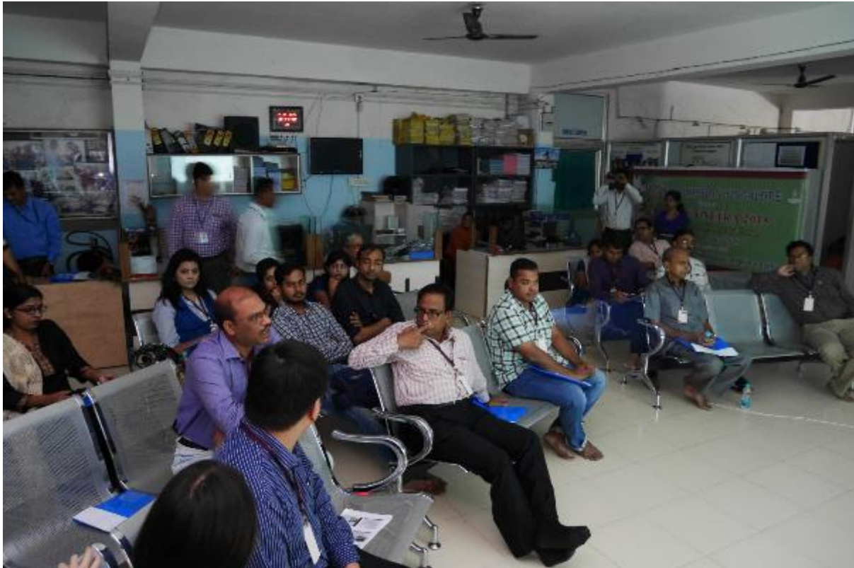
In turn promoting enriching discussions between a Diabetologist and the Ophthalmology Consultants