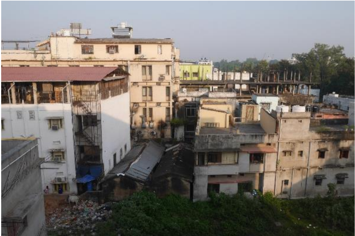
Good morning Orissa! Clear skies and relatively clear air compared to hazy Singapore.