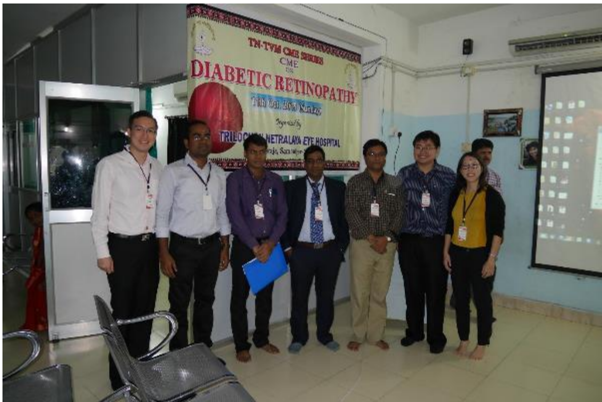
Panel of speakers and organisers