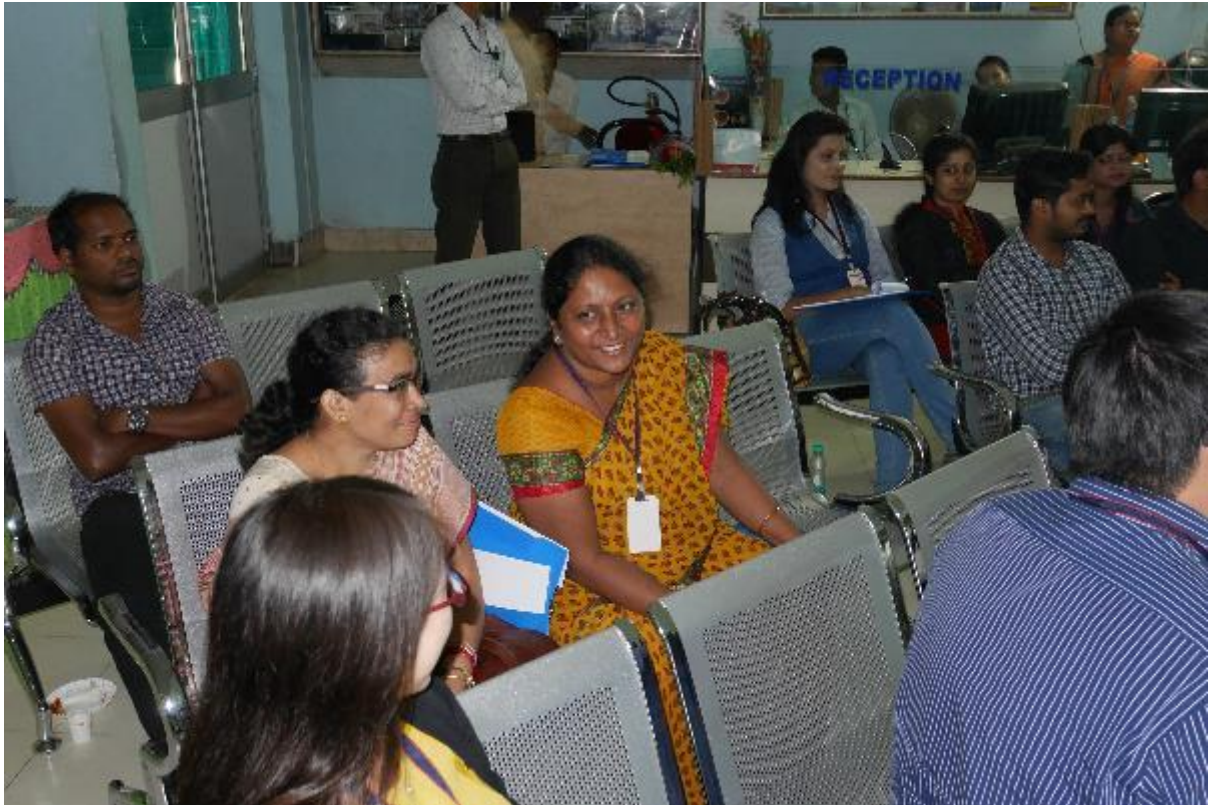
2 lady Consultant Ophthalmologists from the local college