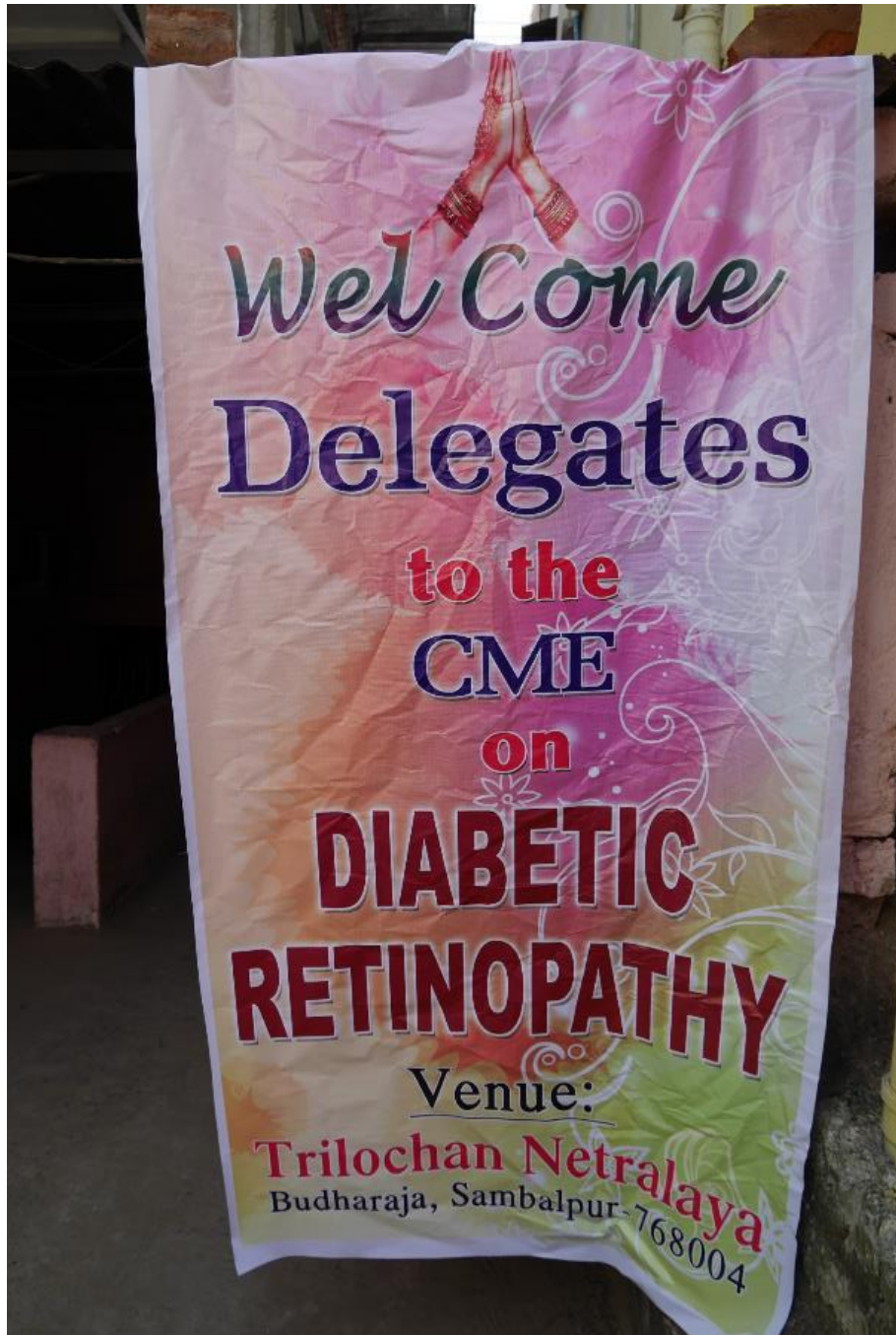
Agenda for the day!