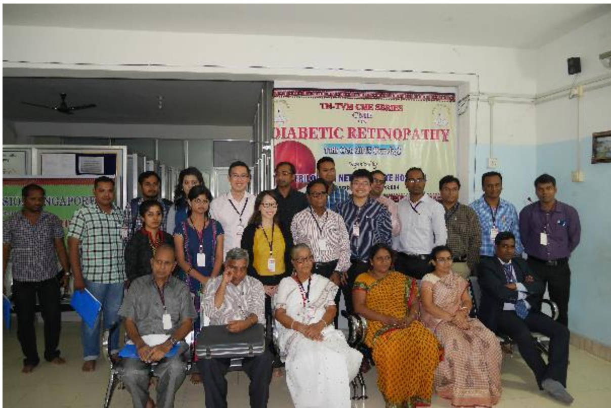
Doctors from all walks gathered