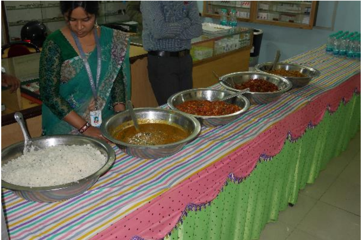
Home cooked Indian food for lunch