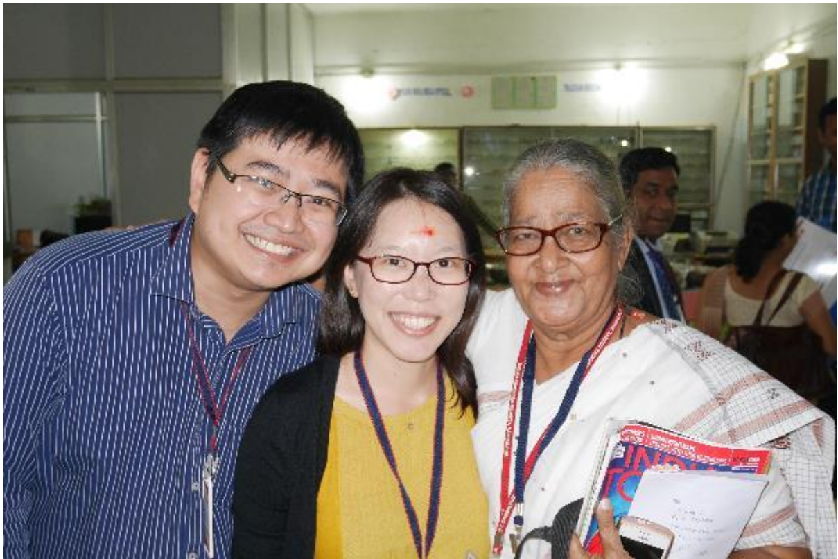
A sweet lady Paediatrician who came for the talks