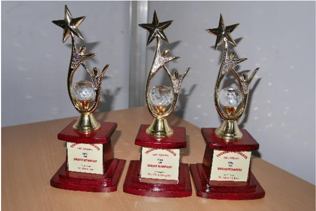
Our tokens of appreciation